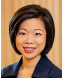
MS SIM ANN SENIOR MINISTER OF STATE MINISTRY OF FOREIGN AFFAIRS AND MINISTRY OF NATIONAL DEVELOPMENT